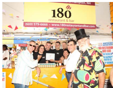
MOST CREATIVE CUISINE 180 Restaurant & Bar