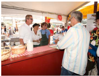
BEST NON-SEAFOOD Muddy River Takeout & Catering