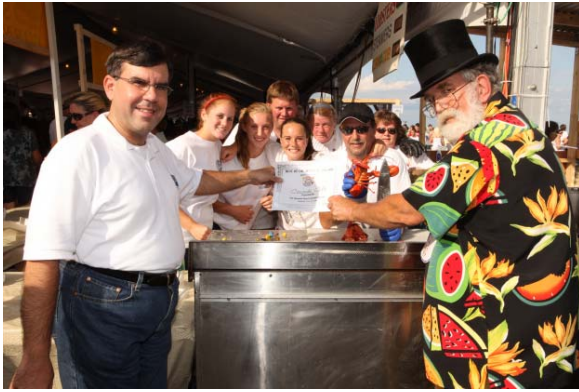
BEST OF THE FESTIVAL Cascade Cafe