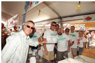
BEST BISQUE OR STEW Dough Express