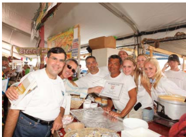
BEST CHOWDER The Old Salt Eating and Drinking Place