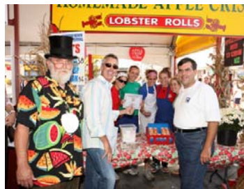
BEST DESSERT Stat's