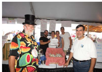
SPECIAL RECOGNITION East Coast Gourmet