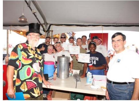
BEST BOOTH DESIGN, FRESHEST CATCH, and BEST SPIRIT North Hampton Firefighters