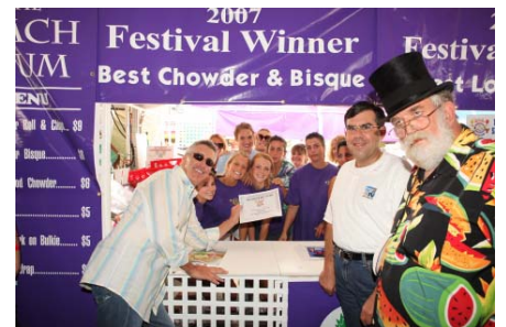
BEST LOBSTER ROLL Beach Plum