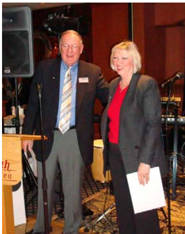
LAS VEGAS TRIP!