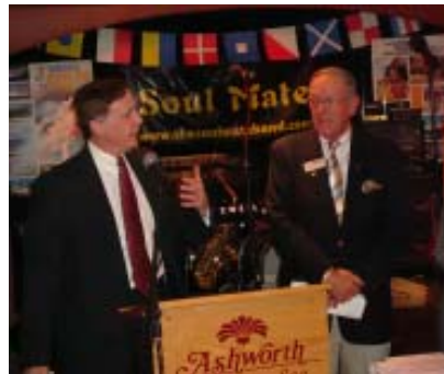
PRESIDENT'S AWARD UNITIL CORPORATION