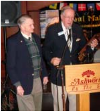
COMMUNITY SERVICE AWARD CHANNEL 22 ADVISORY COMMITTEE