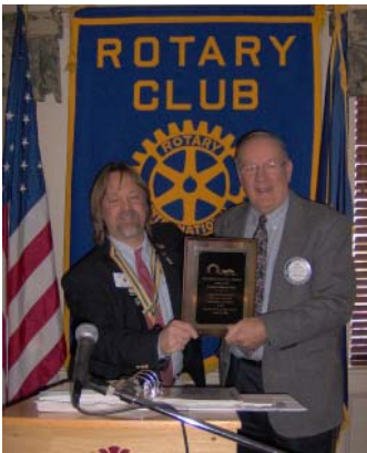
Seafood Festival Award: Hampton Rotary Club