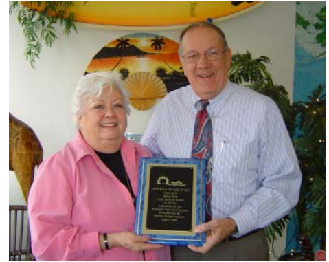
Business of the Year: Custom Travel